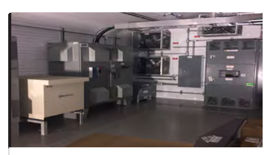
Plug & Play MCC Room